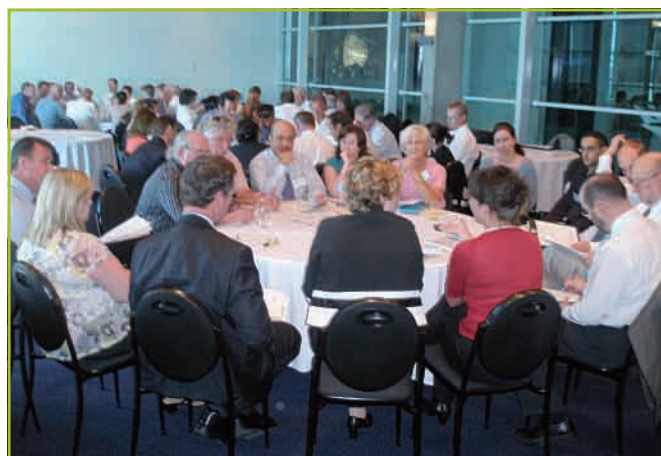
Round Table Discussions